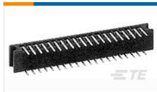
TE Part # 5-532956-1 12 MODII 2PC CE RCPT ASSY, RoH