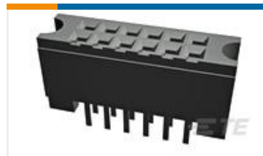
TE Part # 6-534972-5 12 MODII VRT 2PC DR, RoHS