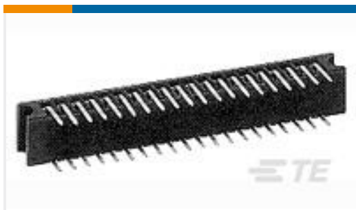
TE Part # 5-534204-2 12 MODU 2-PC CE RECP ASSY, RoHS